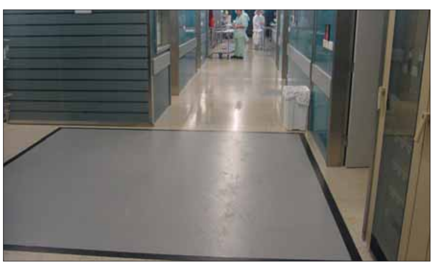
Polymeric flooring will trap particulate contamination and prevent its transfer elsewhere

The micro-organisms detected were identified for some plates. This was for