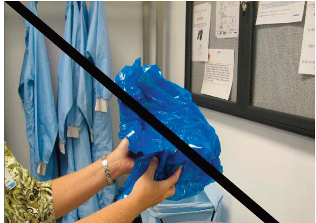
Blue tack mats no longer required