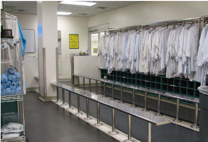
Changing area covered with Dycem Polymeric Floor Coverings